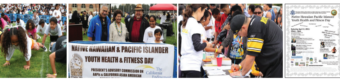
Pacific Islander Fitness Day on April 12, 2011: youth participating in fitness exercises; Congressman Eni Faleomavaega (American Samoa), Assemblymember Warren Furutani, and community members; completing the needs assessment survey; poster announcement.

Chronic disease is the leading cause of death for Pacific Islanders in the U.S. Numbering more than 1.1 million nationwide in the 2010 Census count, the health disparities suffered by Pacific Islanders present a serious concern. Indeed, one out of five Pacific Islander American youth is considered obese. Prevention and reduction of this physical condition are primary goals among community activists. Yet there is little information about the need for physical activity and better nutrition or about cultural beliefs and behaviors.