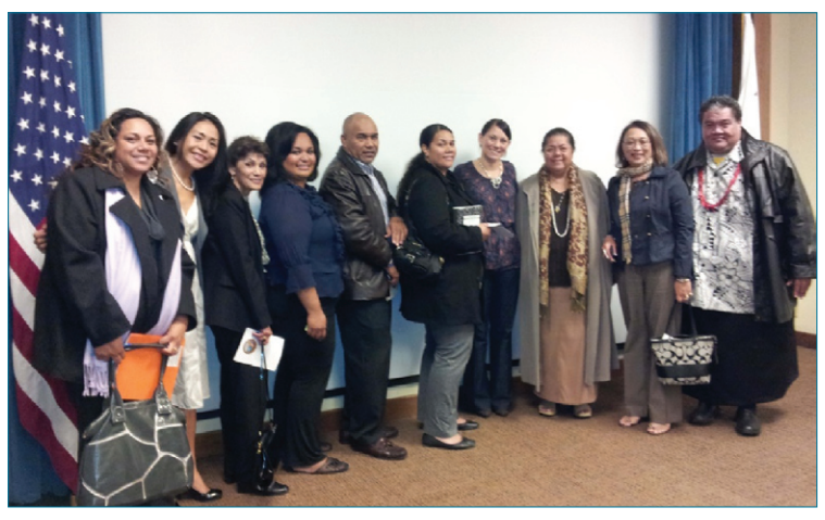
Leaders and activists representing the wide spectrum of APIA community service organizations met with Governor Brown's office at a meet and greet in November.

Capitol tour led by the API Legislative Caucus.